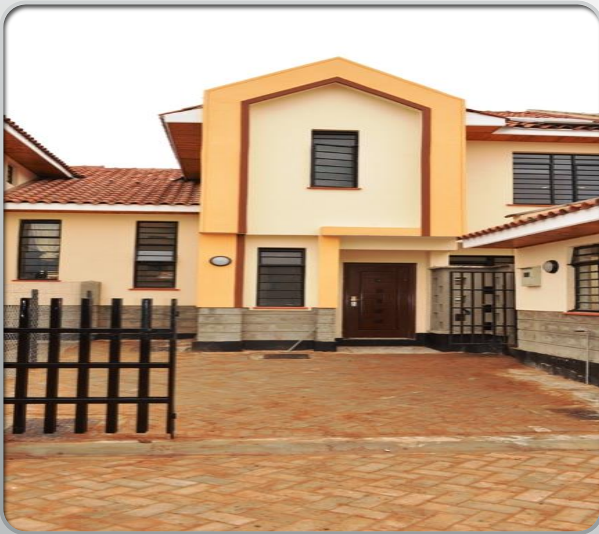
Stima Investment Co-operative Society Complete house at Stima Village.